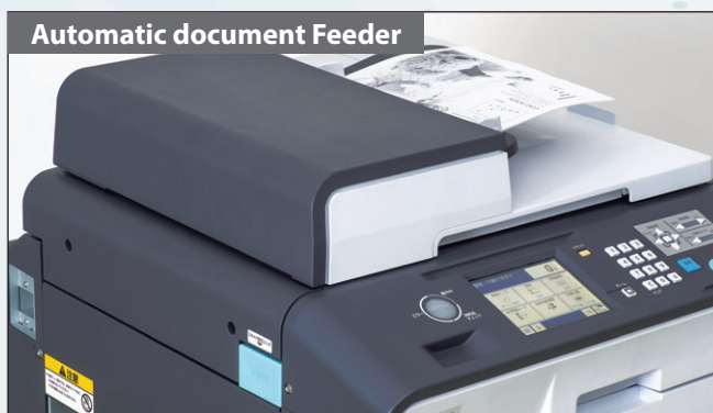
Automatic document Feeder