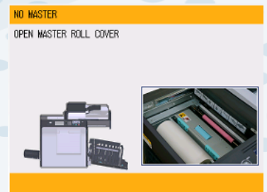
Consumable alarm message