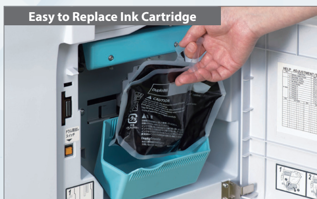
Easy to Replace Ink Cartridge